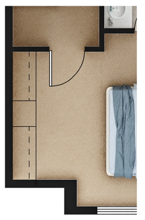
Third Floor Closet Option

Koelbel Urban Homes, LLC reserves the right to modify plans, exterior designs and specifications and may substitute materials and brands of like quality at any time without prior notice. Square footages and dimensions provided are approximate. Effective 12.17.2020