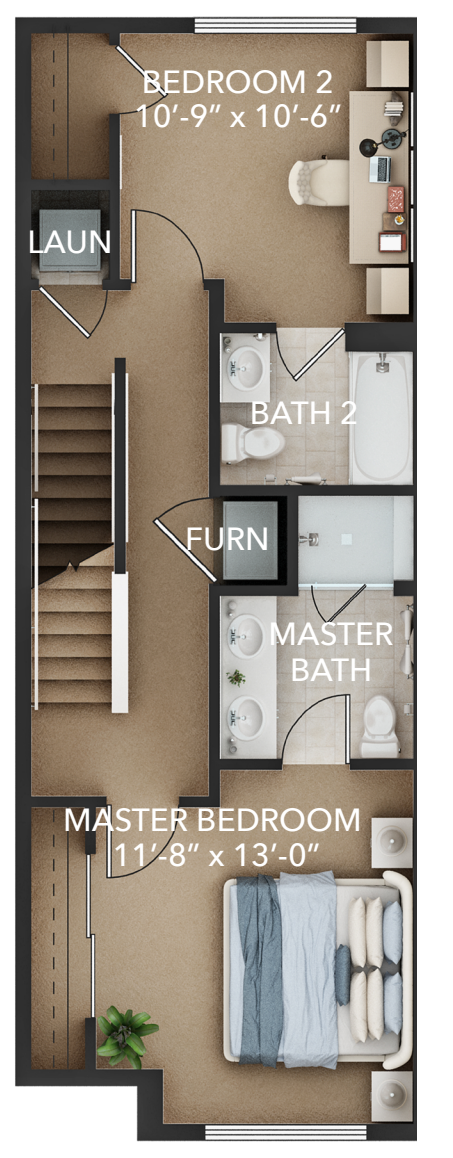
Third Floor Standard