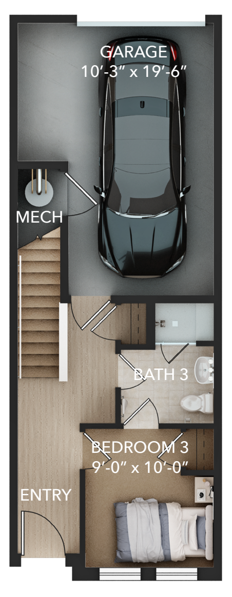
First Floor Bath & Bed